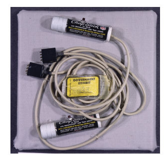
Among the evidence used against the White House Plumbers were hidden microphones placed inside ChapStick containers.

11. A burglary of the Democratic headquarters committed by the supporters of Republican President Richard Nixon in June 1972. Nixon was forced to resign the presidency due to his efforts to cover up the crime.