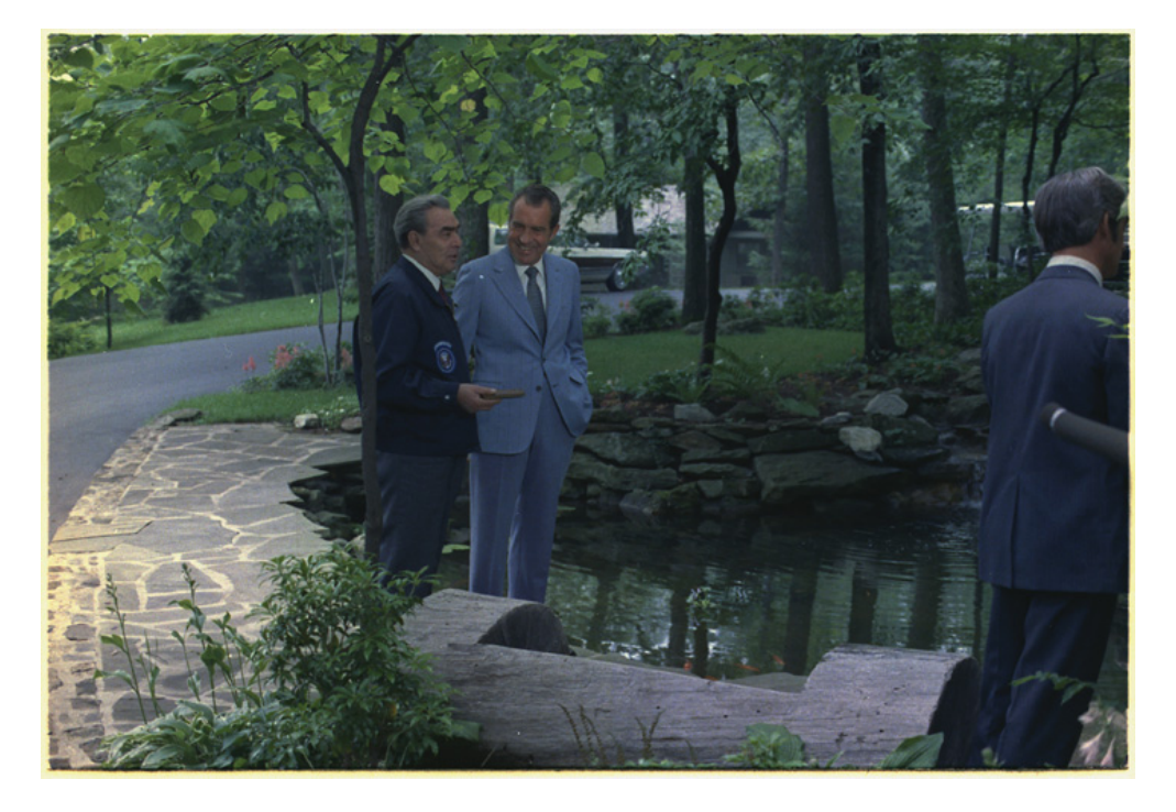
Soviet Premier Leonid Brezhnev meets with Richard Nixon in June 1973.

20. A 1975 treaty signed in Finland intended to reduce Cold War tensions. The United States, Soviet Union, and other nations that signed the treaty agreed to accept the post–World War II division of Europe, including a promise to respect the present borders of nations in Europe. The agreement also committed each nation to honor the UN Declaration of Human Rights.