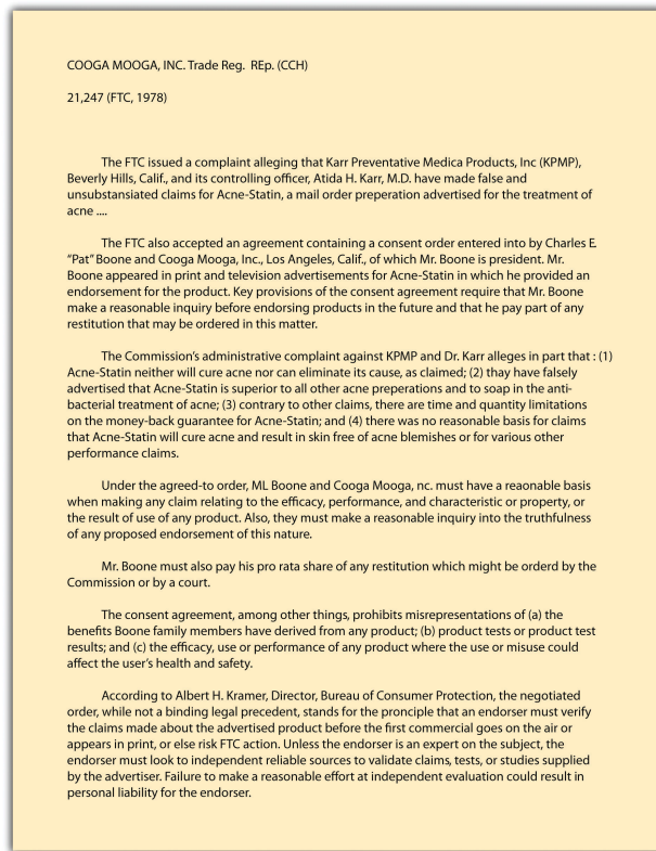
Consent Decree: Pat Boone and Cooga Mooga, Inc.

That a particular consumer is in fact ecstatic about a product does not save a false statement: it is deceptive to present this glowing testimonial to the public if there are no facts to back up the customer's claim. The assertion "I was cured by apricot pits" to market a cancer remedy would not pass FTC muster. Nor may an endorser give a testimonial involving subjects known only to experts if the endorser is not himself that kind of expert, as shown in the consent decree negotiated by the FTC with singer Pat Boone (Figure 17.2).