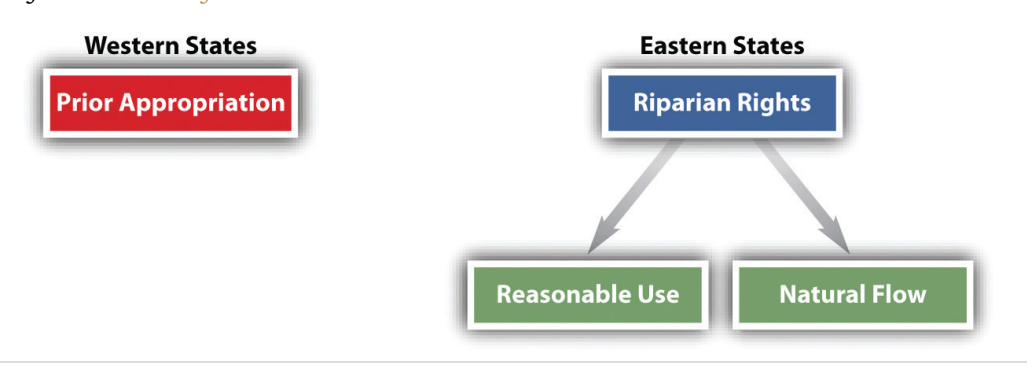
Figure 33.2 Water Rights

In contrast to riparian rights doctrines, western states have adopted the prior appropriation doctrine. This rule looks not to equality of interests but to priority in time: first in time is first in right. The first person to use the water for a beneficial purpose has a right superior to latecomers. This rule applies even if the first user takes all the water for his own needs and even if other users are riparian owners. This rule developed in water-scarce states in which development depended on incentives to use rather than hoard water. Today, the prior appropriation doctrine has come under criticism because it gives incentives to those who already have the right to the water to continue to use it profligately, rather than to those who might develop more efficient means of using it.