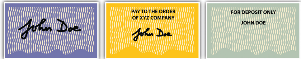
Figure 17.4 Forms of Endorsement

A blank indorsement creates conditional contract liability in the indorser: he is liable to pay if the paper is dishonored. The blank indorser also has warranty liability toward subsequent holders.