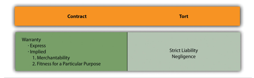
Figure 11.1 Major Products Liability Theories