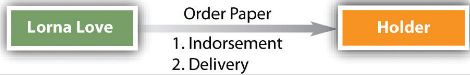
Figure 20.2 Negotiation of Order Paper