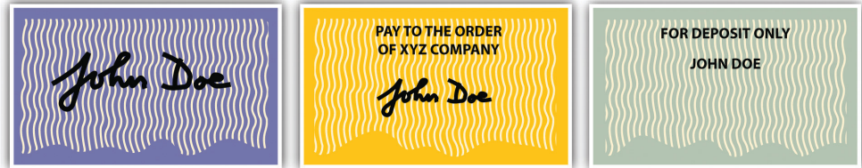
Figure 20.4 Forms of Endorsement

A blank indorsement creates conditional contract liability in the indorser: he is liable to pay if the paper is dishonored. The blank indorser also has warranty liability toward subsequent holders.