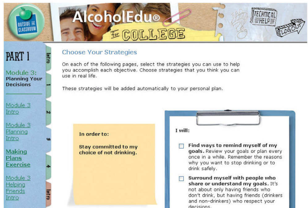
Figure 10.4 The AlcoholEdu Online Alcohol Awareness Program from Outside the Classroom

The goal of these courses is not to preach against drinking. You’ll learn more about the effects of alcohol on the body and mind. You’ll learn about responsible drinking versus high-risk drinking. You’ll think about your own attitudes and learn coping strategies to help prevent or manage a problem. These courses are designed for you—to help you succeed in college and life. They’re worth taking seriously.