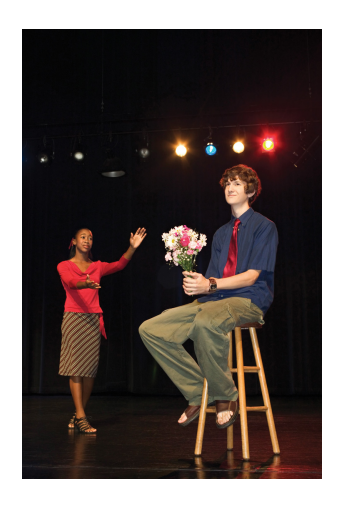
Erving Goffman's dramaturgical approach likened social interaction to acting in a theatrical performance.

Such impression management <sup>29</sup>, Goffman wrote, also guides social interaction in everyday life. When people interact, they routinely try to convey a positive impression of themselves to the people with whom they interact. Our behavior in a job interview differs dramatically (pun intended) from our behavior at a party. The key dimension of social interaction, then, involves trying to manage the impressions we convey to the people with whom we interact. We usually do our best, consciously or unconsciously, to manage the