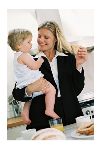
Parents can often experience role conflict stemming from the fact that they have both parental

One thing is clear: you cannot perform both roles at the same time. To resolve role conflict, we ordinarily have to choose between one role and the other, which is often a difficult choice to make. In this example, if you take care of your child, you miss your classes and exam; if you go to your classes, you have to leave your child at home alone, an unacceptable and illegal option. Another way to resolve role conflict is to find some alternative that would meet the needs of your conflicting roles. In our sick child example, you might be able to find someone to watch your child until you can get back from classes. It is certainly desirable to find such alternatives, but, unfortunately, they are not always forthcoming. If role conflict becomes too frequent and severe, a final option is to leave one of your statuses altogether. In our example, if you find it too difficult to juggle your roles as parent and student, you could stop being a parent—hardly likely!—or, more likely, take