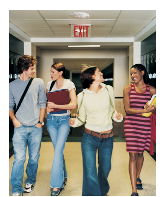
Social interaction is a fundamental feature of social life. For social order to be possible, effective social interaction must also be possible.

<u>Chapter 4 "Socialization"</u> emphasized that socialization results from our social interaction. The reverse is also true: we learn how to interact from our socialization. We have seen many examples of this process in earlier chapters. Among other things, we learn from our socialization how far apart to stand when talking to someone else, we learn to enjoy kissing, we learn how to stand and behave in an elevator, and we learn how to behave when we are drunk. Perhaps most important for the present discussion, we especially learn our society's roles, outlined earlier as a component of social structure. The importance of roles for social interaction merits further discussion here.