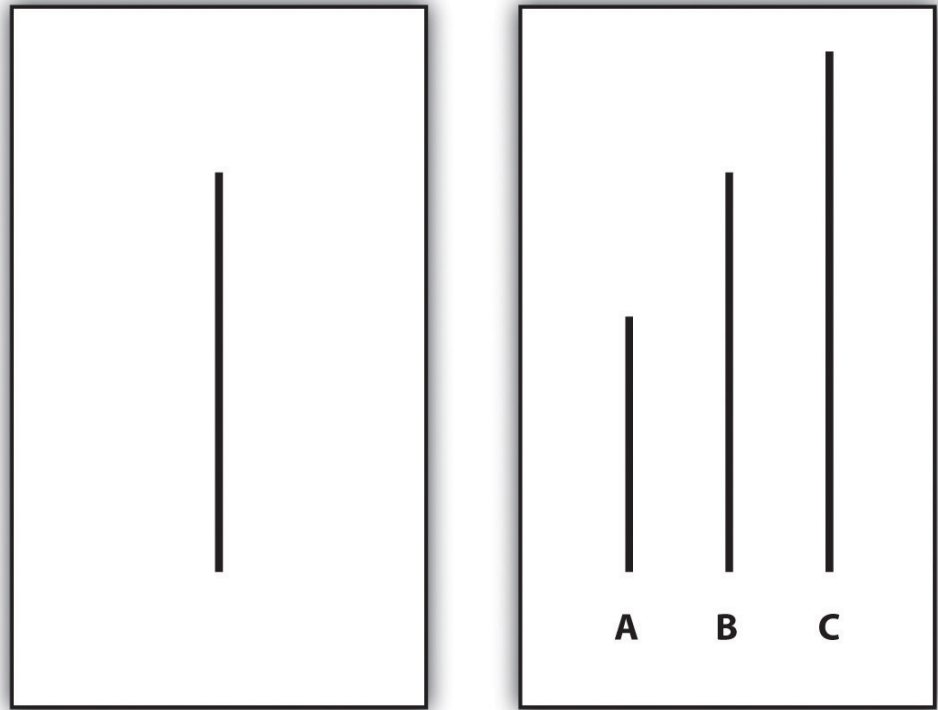
Figure 4.7 Examples of Cards Used in Asch's Experiment

Next, he had students meet in groups of at least six members and told them he was testing their visual ability. One by one he asked each member of the group to identify which of the three lines was the same length as the single line. One by one each student gave a wrong answer. Finally, the last student had to answer, and about one-third of the time the final student in each group also gave the wrong answer that everyone else was giving.