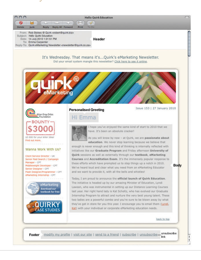
Figure 2.2 HTML E-mail with Key Elements Shown