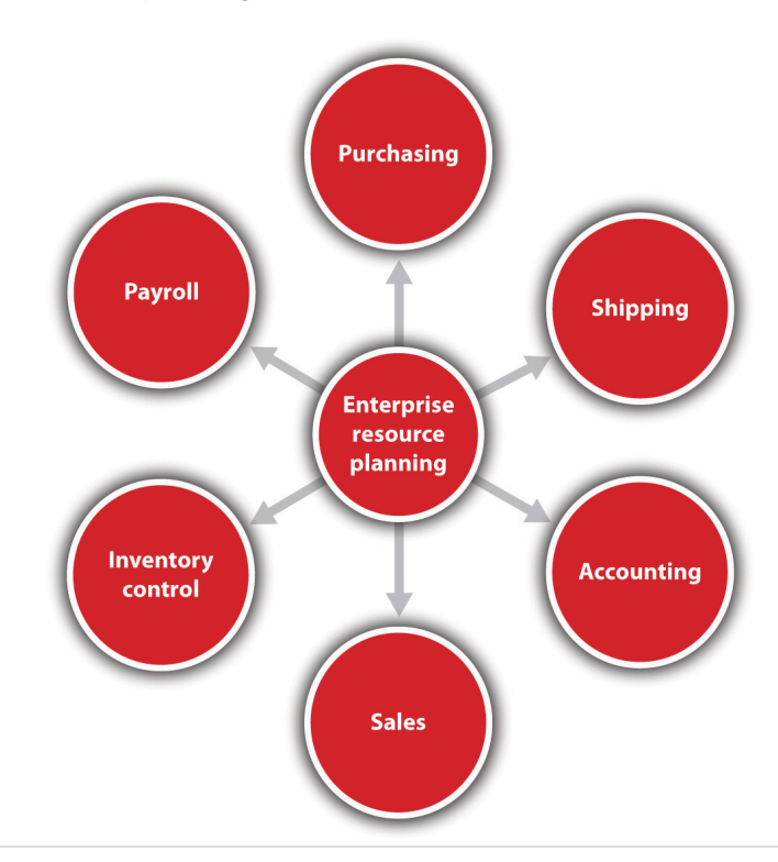
Figure 1.2 Broad Schematic of an ERP System

Touch screen computers, smartphones, or iPads can bring a new level of sophistication to data entry and manipulation and communications. Smartphones can boost productivity, especially when out of the office. Christopher Elliott, "5 Ways Smartphones & Servers Boost Productivity," Microsoft Small Business Center, 2010, accessed October 7, 2011, www.microsoft.com/business/en-us/resources/ technology/communications/smartphones-and-business productivity.aspx?fbid=WTbndqFrlli. It is predicted that the iPad will change how we build business relationships, particularly with respect to connecting with prospects in a more meaningful way. Brent Leary, "The iPad: Changing How We Build Business Relationships," Inc., accessed October 7, 2011, www.inc.com/ hardware/articles/201005/leary.html. Inventory control may soon be revolutionized by a technology known as radio-frequency identity devices (RFIDs)<sup>47</sup>. These small devices enable the tracking of inventory items. These same devices may change retailing by curtailing time at checkout and eliminating pilferage. Kevin Bonsor, Candace Keener, and Wesley Fenlon, "How RFID Works," HowStuffWorks.com, accessed October 23, 2011, electronics.howstuffworks.com/ gadgets/high-tech-gadgets/rfid.htm.