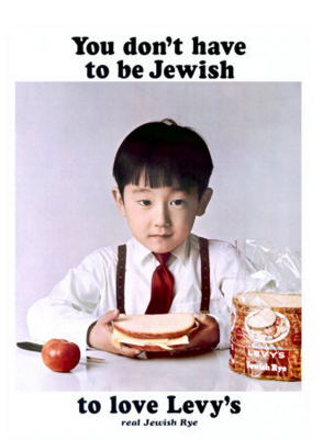
Unusual for the time, Levy's rye bread ads made diversity a selling point.

Early advertising frequently reached out to women because they made approximately 80 percent of all consumer purchases. Thus, women were well represented in advertising. However, those depictions presented women in extremely narrow roles. Through the 1960s, ads targeting women generally showed them performing domestic duties such as cooking or cleaning, whereas ads targeting men often placed women in a submissive sexual role even if the product lacked any overt sexual connotation. A National Car Rental ad from the early 1970s featured a disheveled female employee in a chair with the headline "Go Ahead, Take Advantage of Us." Another ad from the 1970s pictured a man with new Dacron slacks standing on top of a woman, proclaiming, "It's nice to have a girl around the