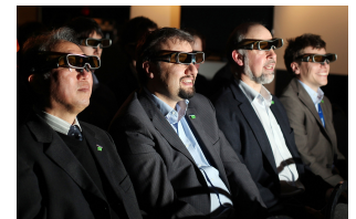
Resurgence of 3-D.

http://www.popularmechanics.com/technology/digital/3d/4310810 . One of the downfalls that lead to the decline of 3-D in the 1950s was the "3-D headache" phenomenon audiences began to experience as a result of technical problems with filming. John Hayes, "You See Them WITH Glasses! A Short History of 3D Movies," Wide Screen Movies Magazine , 2009, http://widescreenmovies.org/wsm11/3D.htm . To create the 3-D effect, filmmakers need to calculate the point where the overlapping images converge, an alignment that had to be performed by hand in those early years. And for the resulting image to come through clearly, the parallel cameras must run in perfect sync with one another—another impossibility with 35-millimeter film, which causes some distortion by the very fact of its motion through the filming camera.