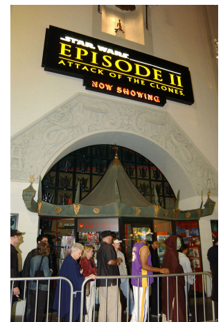
Attack of the Clones: First Film to Be Made with Digital Cinematography.