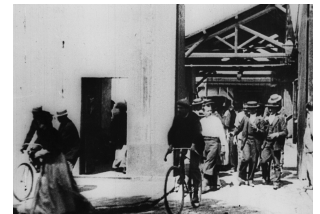
Workers Leaving the Lumière Factory: One of the first films viewed by an audience.