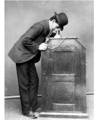
The Edison kinoscope.

Because Edison hadn’t secured an international patent for his invention, variations of the kinoscope were soon being copied and distributed throughout Europe. This new form of entertainment was an instant success, and a number of mechanics and inventors, seeing an opportunity, began toying with methods of projecting the moving images onto a larger screen. However, it was the invention of two brothers, Auguste and Louis Lumière—photographic goods manufacturers in Lyon, France—that saw the most commercial success. In 1895, the brothers patented the Cinématographe 4 (from which we get the term cinema ), a lightweight film projector that also functioned as a camera and printer. Unlike the Edison kinoscope, the Cinématographe was lightweight enough for easy outdoor filming, and over the years the brothers used the camera to take well over 1,000 short films, most of which depicted scenes from everyday life. In December 1895, in the basement lounge of the Grand Café, Rue des Capucines in Paris, the Lumières held the world’s first ever commercial film screening, a sequence of about 10 short scenes, including the brother’s first film, Workers Leaving the Lumière Factory , a segment lasting less than a minute and depicting workers leaving the family’s photographic instrument factory at the end of the day, as shown in the still frame here in Figure 8.3 . Encyclopedia of the Age of Industry and Empire , s.v. “Cinema.”