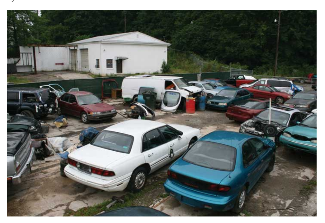
The federal government's Cash for Clunkers program resulted in a significant short-term increase in new car sales and filled junkyards with thousands of clunkers!