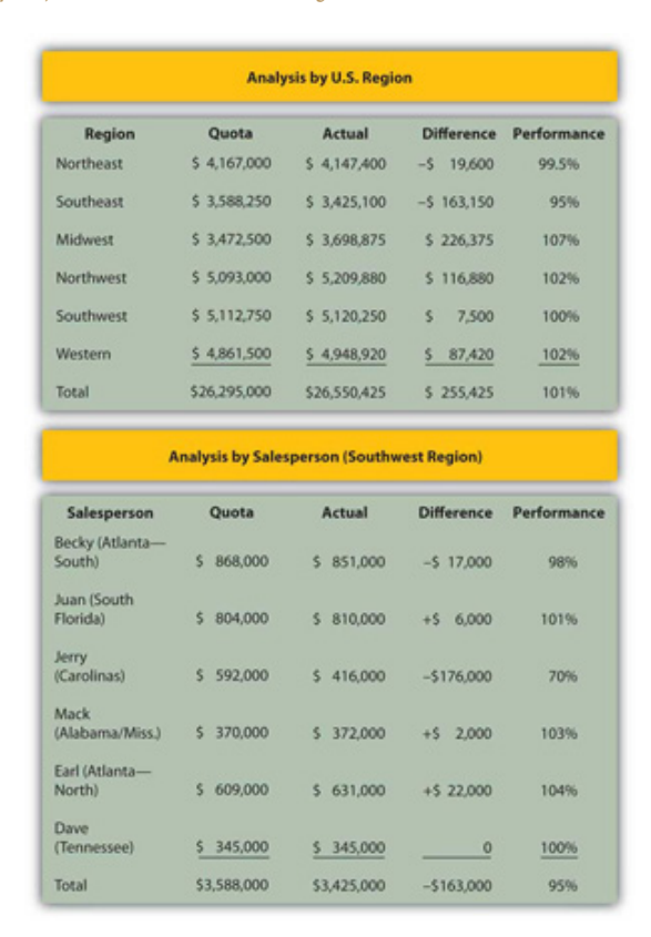
Figure 13.11 An Example of the Sales Data Sales Managers Utilize

Tables such as this provide information that managers use to evaluate sales performance against expected sales, or quota.