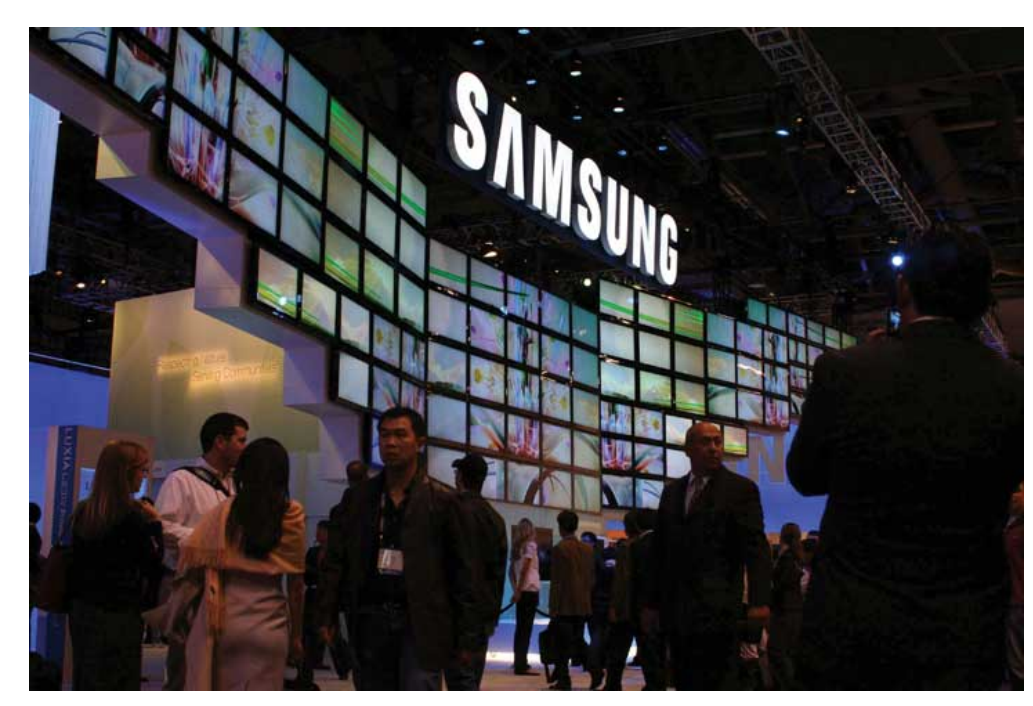
Figure 12.5 A Samsung Display at the Consumer Electronics (CES) Trade Show in Las Vegas, Nevada, in 2009