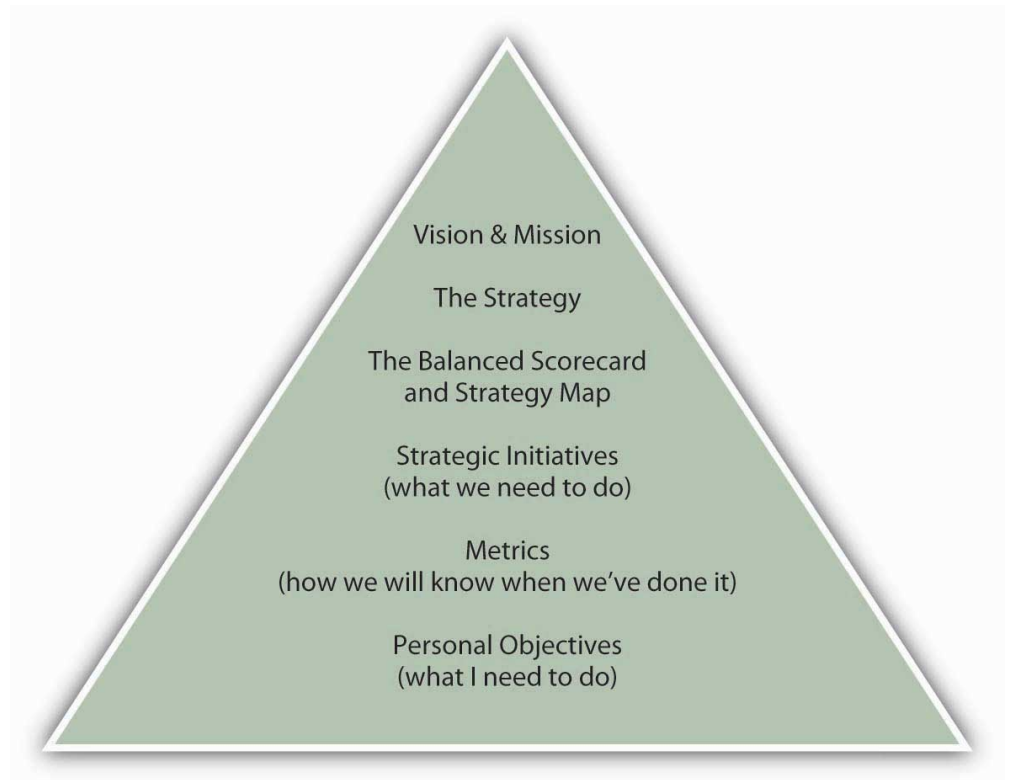
Figure 15.11 The Balanced Scorecard Hierarchy

With the scorecard and strategy map in hand, managers then break broad goals down successively into vision, strategies, strategic initiatives, and metrics. As an example, imagine that an organization has a goal of maintaining employee satisfaction in its vision and mission statements. This would be the organization's vision in the domain of learning and growth, since employee satisfaction is indirectly related to financial performance. Strategies for achieving that learning and growth vision might include approaches such as increasing employee-management communication. Initiatives undertaken to implement the strategy could include, for example, regularly scheduled meetings with employees. Metrics could include quantifications of employee suggestions or employee surveys. Finally, managers would want to test their assumptions about the relationship between employee satisfaction and the downstream areas such as internal, customer, and financial performance. For example, satisfied employees may be more productive and less likely to quit (internal), which leads to better products or services and customer relations (customer), which leads to lower employee recruiting and training costs and greater sales and repeat sales (financial). This sequence of causal relationships is summarized in the following figure.