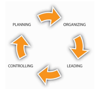
Figure 15.5 Controls as Part of a Feedback Loop

Why might it be helpful for you to think of controls as part of a feedback loop in the P-O-L-C process? Well, if you are the entrepreneur who is writing the business plan for a completely new business, then you would likely start with the planning component and work your way to controlling—that is, spell out how you are going to tell whether the new venture is on track. However, more often, you will be stepping into an organization that is already operating, and this means that a plan is already in place. With the plan in place, it may be then up to you to figure out the organizing, leading, or control challenges facing the organization.