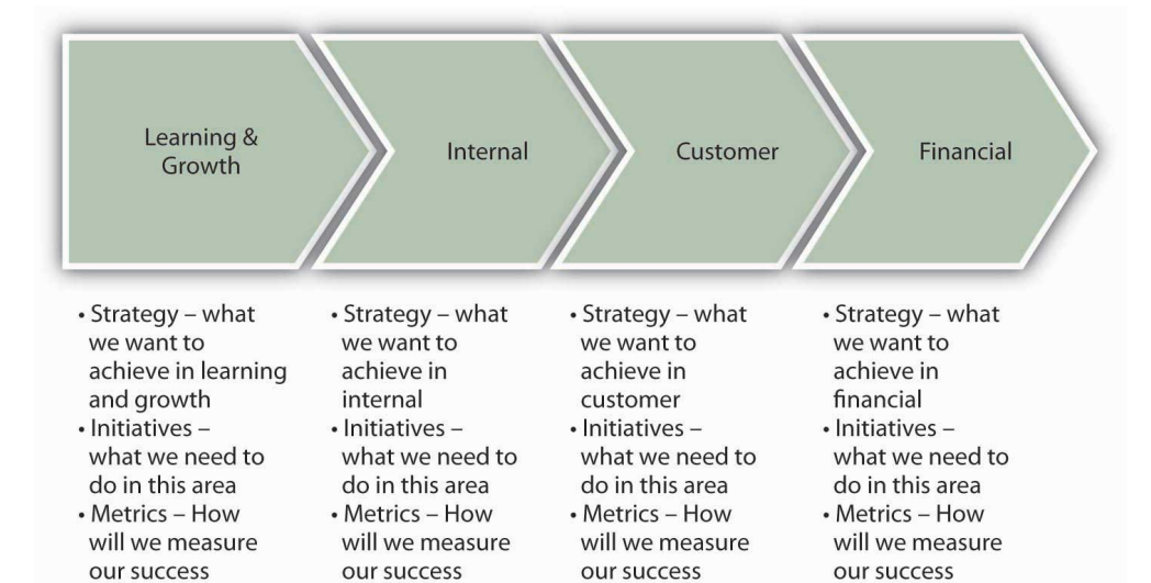
Figure 15.12 The Strategy Map: A Causal Relationship between Nonfinancial and Financial Controls