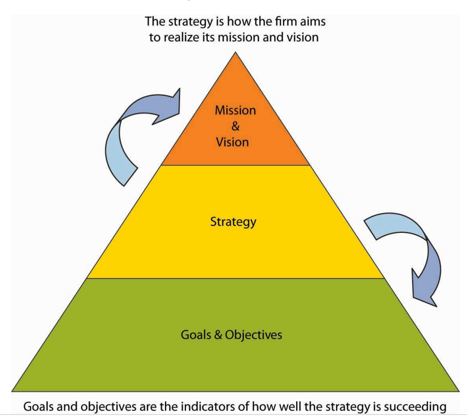
Figure 4.3 Mission and Vision in the Planning Process