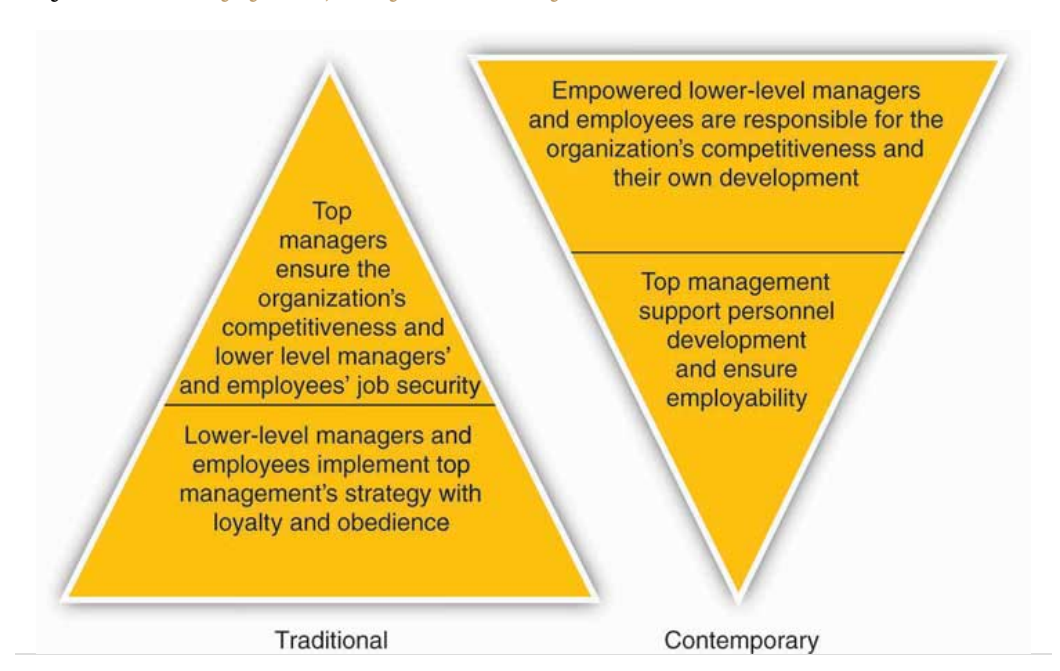
Figure 1.4 The Changing Roles of Management and Managers

A general manager is someone who is responsible for managing a clearly identifiable revenue-producing unit, such as a store, business unit, or product line. General managers typically must make decisions across different functions and have rewards tied to the performance of the entire unit (i.e., store, business unit, product line, etc.). General managers take direction from their top executives. They must first understand the executives' overall plan for the company. Then they set specific goals for their own departments to fit in with the plan. The general manager of production, for example, might have to increase certain product lines and phase out others. General managers must describe their goals clearly to their support staff. The supervisory managers see that the goals are met.