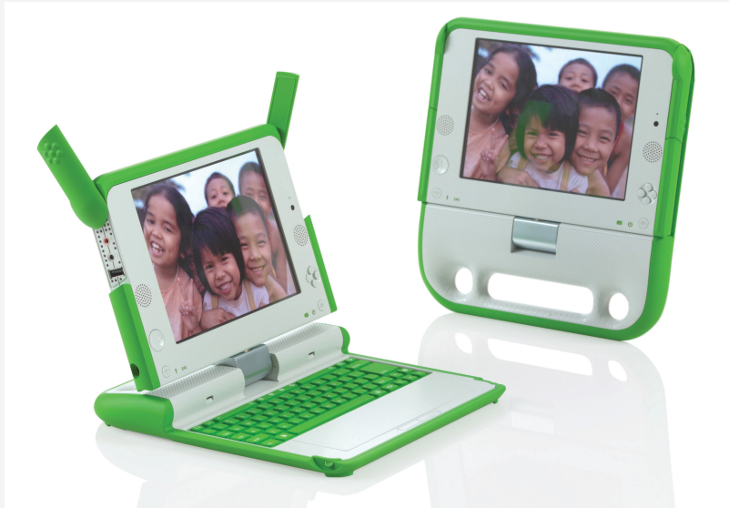
Figure 5.4 The XO PC