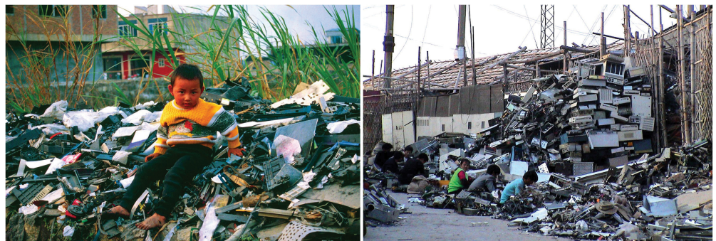
Figure 5.5 Photos from Guiyu, China. J. Biggs, "Guiyu, the E-waste Capital of China," CrunchGear , April 4, 2008.