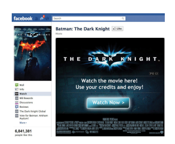
Figure 8.1 Is Facebook Coming after Your Business?

Facebook has turned on features and engaged in partnerships that compete with offerings from a wide variety of firms. In this example, Warner Bros. has partnered with Facebook to offer streaming video rental.