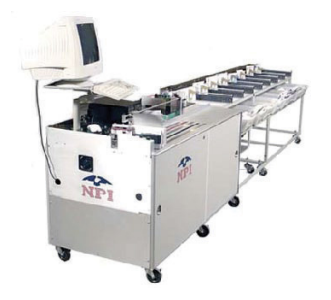
Figure 4.5 A Proprietary Netflix Sorting Machine