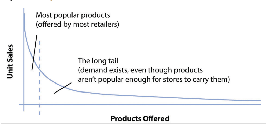
Figure 4.2 The Long Tail

The long tail works because the cost of production and distribution drop to a point where it becomes economically viable to offer a huge selection. For Netflix, the cost to stock and ship an obscure foreign film is the same as sending out the latest Will Smith blockbuster. The long tail gives the firm a selection advantage (or one based on scale) that traditional stores simply cannot match.