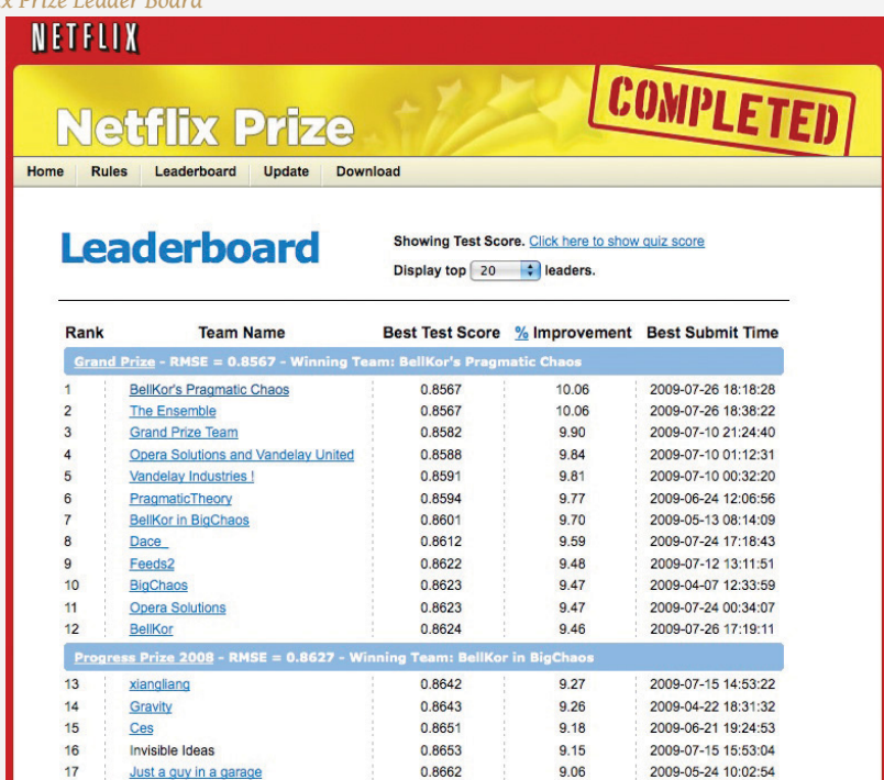
Figure 4.4 The Netflix Prize Leader Board