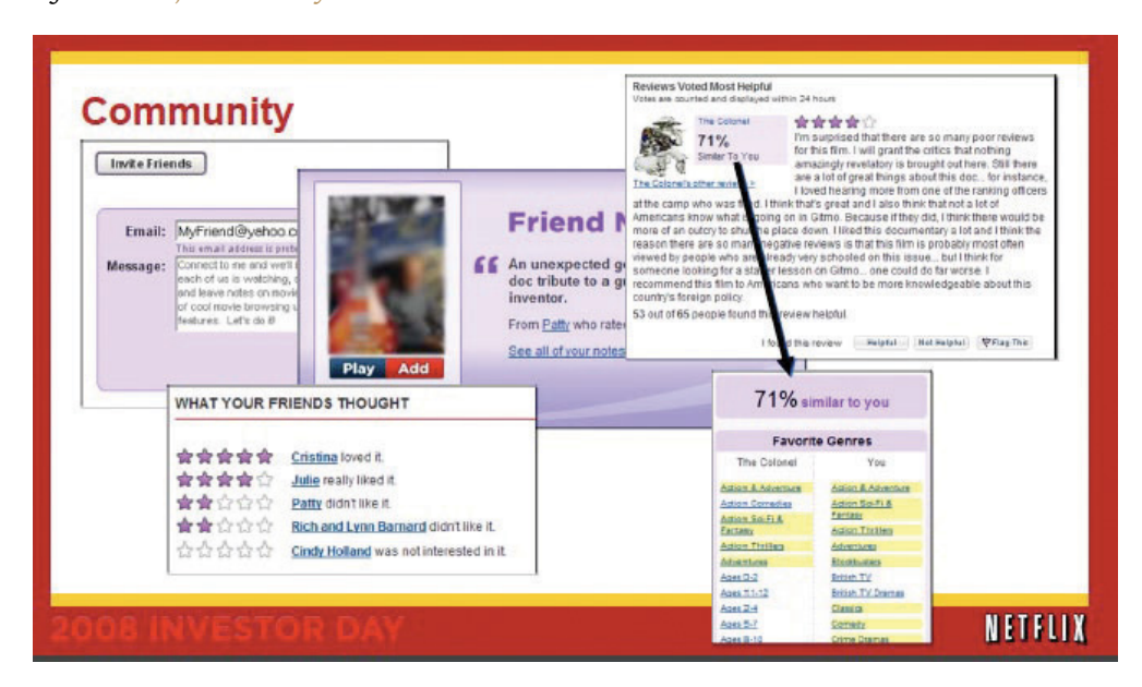
Figure 4.3 Netflix Community Features

only with those items the software predicts they'll most likely be interested in. The kind of data mining done by collaborative filtering isn't just used by Netflix; other sites use similar systems to recommend music, books, even news stories. While other firms also employ collaborative filtering, Netflix has been at this game for years, and is constantly tweaking its efforts. The results are considered the industry gold standard.