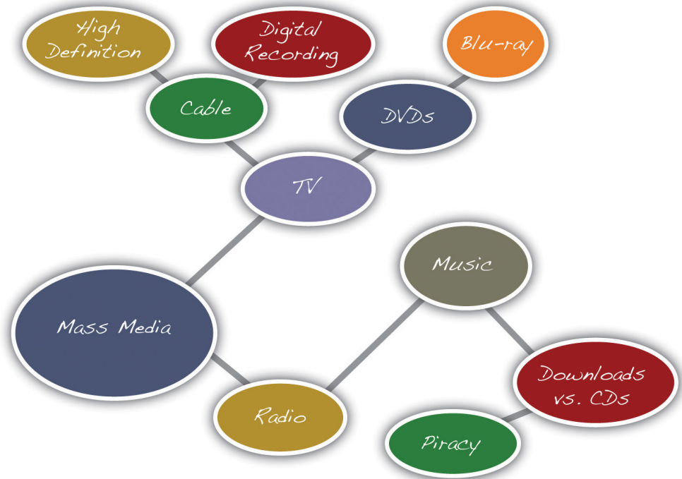
Figure 7.2 Idea Map

Notice Mariah’s largest circle contains her general topic, mass media. Then, the general topic branches into two subtopics written in two smaller circles: television and radio. The subtopic television branches into even more specific topics: cable and DVDs. From there, Mariah drew more circles and wrote more specific ideas: high definition and digital recording from cable and Blu-ray from DVDs. The radio topic led Mariah to draw connections between music, downloads versus CDs, and, finally, piracy.