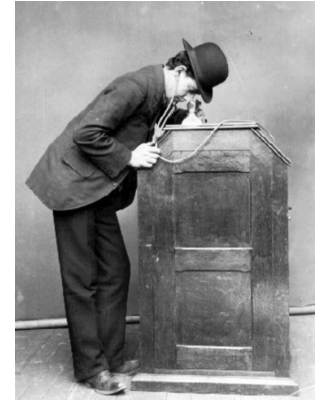
The Edison kinetoscope.

Because Edison hadn’t secured an international patent for his invention, variations of the kinetoscope were soon being copied and distributed throughout Europe. This new form of entertainment was an instant success, and a number of mechanics and inventors, seeing an opportunity, began toying with methods of projecting the moving images onto a larger screen. However, it was the invention of two brothers, Auguste and Louis Lumière—photographic goods manufacturers in Lyon, France—that saw the most commercial success. In 1895, the brothers patented the cinématographe 4 (from which we get the term cinema ), a lightweight film projector that also functioned as a camera and printer. Unlike the Edison kinetograph, the cinématographe was lightweight enough for easy outdoor filming, and over the years the brothers used the camera to take well over 1,000 short films, most of which depicted scenes from everyday life. In December 1895, in the basement lounge of the Grand Café, Rue des Capucines in Paris, the Lumières held the world’s first ever commercial film screening, a sequence of about 10 short scenes, including the brother’s first film, Workers Leaving the Lumière Factory , a segment lasting less than a minute and depicting workers leaving the family’s photographic instrument factory at the end of the day, as shown in the still frame here in Figure 8.3 . Encyclopedia of the Age of Industry and Empire , s.v. “Cinema.”