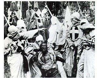
The Birth of a Nation expressed racial tensions of the early 20th century.

These early World War II films were sometimes overtly propagandist, intended to influence American attitudes rather than present a genuine reflection of American sentiments toward the war. Frank Capra's Why We Fight films, for example, the first of which was produced in 1942, were developed for the U.S. Army and were later shown to general audiences; they delivered a war message through narrative. Clayton R. Koppes and Gregory D. Black, Hollywood Goes to War: How Politics, Profits and Propaganda Shaped World War II Movies (Los Angeles: The Free Press, 1987), 122. As the war continued, however, filmmakers opted to forego patriotic themes for a more serious reflection of American sentiments, as exemplified by films like Alfred Hitchcock's Lifeboat .