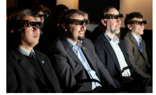
Resurgence of 3-D.