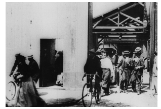
Workers Leaving the Lumière Factory: One of the first films viewed by an audience.