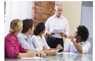
Focus groups are effective ways to obtain a group opinion on media.