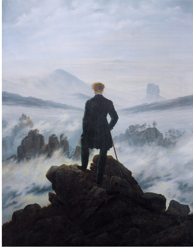
Painting by Caspar David Friedrich, The Wanderer above the Sea of Fog (1818).

To get a better sense of these concerns, let's look at "The World Is Too Much with Us," a poem written by one of the most well-known Romantics, William Wordsworth. William Wordsworth, "The World Is Too Much with Us," Poets.org, http://www.poets.org/viewmedia.php/prmMID/15878 . It was published in 1807.