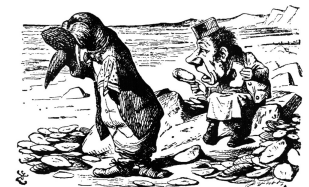
Illustration by Sir John Tenniel for Lewis Carroll's Through the Looking Glass and What Alice Found There (1872).

Look at the illustration of this scene: you see the Carpenter looking a little sick from overeating, and oyster shells strewn all around the beach like litter. It's a scene of excess, of ill restraint. After hearing this story, Alice can't decide which character was most unpleasant—the Walrus, who consumed the most oysters, or the Carpenter, who seemed unrepentant for his deceit. Alice, then, sees two moral problems in what the Walrus and the Carpenter do in the poem. First, she rejects their lack of sympathy for the Oysters, and second, she rejects the wastefulness of their consumption. In the end, Alice simply decides, "Well! They were both very unpleasant characters." Part of what makes them so unpleasant, an ecocritic might suggest, is that they view the natural world and its creatures as theirs to exploit, with no repercussions or responsibilities on their part.