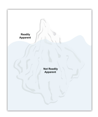
Figure 14.5 American Foreign Service Manual Iceberg Model

Manual Iceberg Model" for an illustration of an "iceberg model" adapted from the American Foreign Service Manual. American Foreign Service Manual. (1975). This model has existed in several forms since the 1960s, and serves as a useful illustration of how little we perceive of each other with our first impressions and general assumptions.