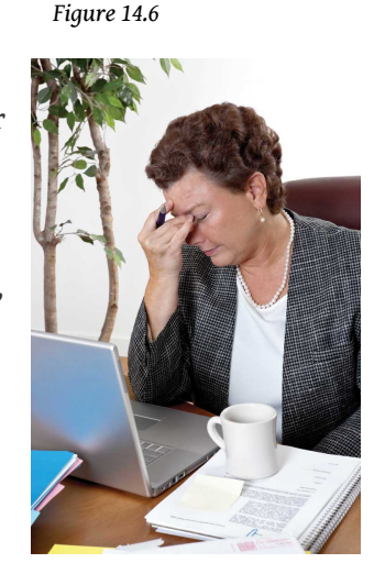
Emotions are often communicated through nonverbal gestures and actions.

Experiencing feelings and actually letting someone know you are experiencing them are two different things. We experience feeling in terms of our psychological state, or state of mind, and in terms of our physiological state, or state of our body. If we experience anxiety and apprehension before a test, we may have thoughts that correspond to our nervousness. We may also have an increase in our pulse, perspiration, and respiration (breathing) rate. Our expression of feelings by our body influences our nonverbal communication, but we can complement, repeat, replace, mask, or even contradict our verbal messages. Remember that we can't tell with any degree of accuracy what other people are feeling simply through observation, and neither can they tell what we are feeling. We need to ask clarifying questions to improve understanding. With this in mind, plan for a time to provide responses and open dialogue after the conclusion of your speech.