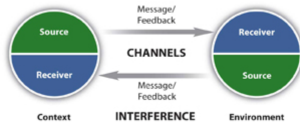
Figure 1.3 Transactional Model of Communication