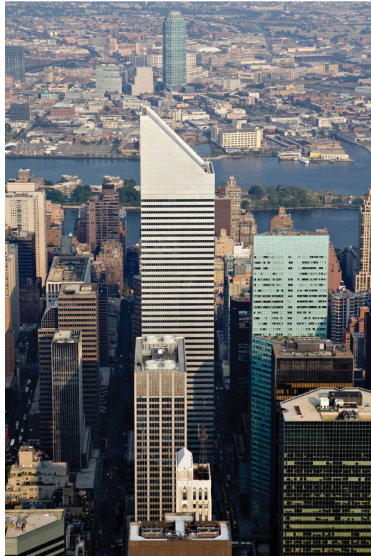
Figure 7.2 Citibank Global Headquarters in New York City

For example, US-based Citigroup is the world's largest financial services network, with 16,000 offices in 160 countries and jurisdictions, holding 200 million customer accounts. It's a financial powerhouse with operations in retail, private, business, and investment banking, as well as asset management. Citibank's global reach make it a good banking partner for large global firms that want to be able to manage the financial needs of their employees and the company's operations around the world.