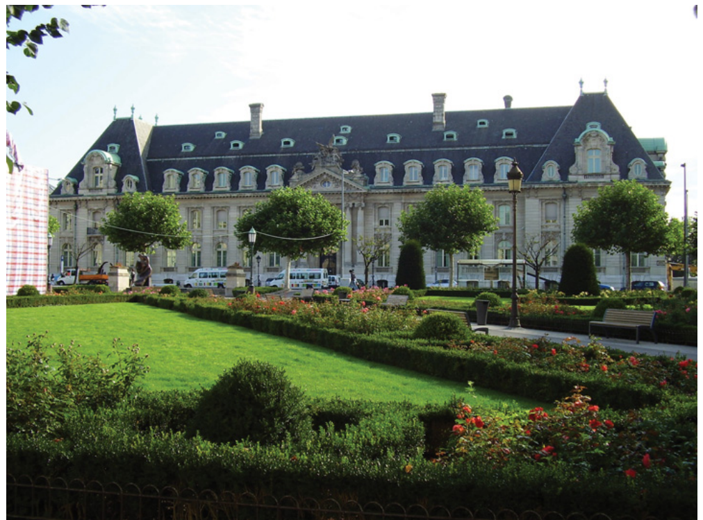
Figure 7.1 ArcelorMittal Global Headquarters

Companies sell their stock in the equity markets. International equity markets consists of all the stock traded outside the issuing company's home country. Many large global companies seek to take advantage of the global financial centers and issue stock in major markets to support local and regional operations.