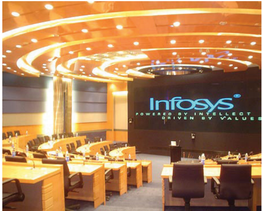
Figure 1.1 Infosys Bangalore Hall

Infosys is a multibillion-dollar global IT and consulting firm headquartered in India.