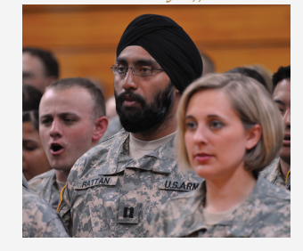
Figure 12.5 Captain Tejdeep Singh Rattan, the First Sikh Army Officer