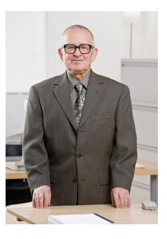
Older workers are protected from employment discrimination.