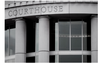
Figure 10.2 Courthouse

Imagine a bookkeeper who works for a physicians group. This bookkeeper's job is to collect invoices that are due and payable by the physicians group and to process the payments for those invoices. The bookkeeper realizes that the physicians themselves are very busy, and they seem to trust the bookkeeper with the task of figuring out what needs to be paid. She decides to create a fake company, generate bogus invoices for "services rendered," and send the invoices to the physicians group for payment. When she processes payment for those invoices, the fake company deposits the checks in its bank account—a bank account she secretly owns. This is a fraudulent disbursement, and it is just one of many ways in which crime occurs in the workplace. Check out Note 10.4 "Hyperlink: Thefts, Skimming, Fake Invoices, Oh My!" to examine several other common embezzlement schemes easily perpetrated by trusted employees.