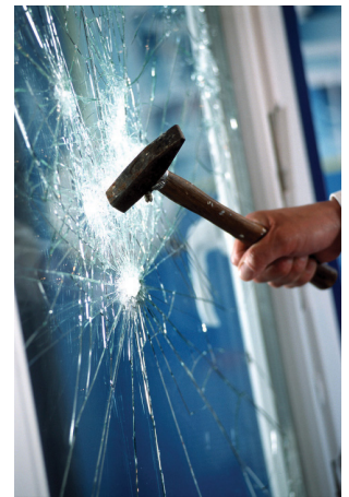
Figure 10.5 Burglary

Businesses should conduct annual training sessions, such as ethics training, to help ensure good workplace ethics. They should develop company-wide codes of ethics, which serve as the organizational commitment to ethical behavior. This can go far toward developing a corporate culture that values ethical behavior and condemns unethical actions, by providing leadership that serves as positive role models for all employees. Some companies, such as Boeing, have instituted an ethics hotline, which allows employees to anonymously report unethical behavior so that it can be investigated. Additionally, federal sentencing guidelines in place for organizations state that organizations that maintain a rigorous compliance program to detect and report violations of the law, and voluntarily disclose those violations when they occur, are eligible for significantly reduced sentences and fines.