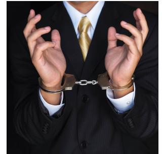
Figure 10.1 Businessperson in Trouble

Consider the photo in Figure 10.1 "Businessperson in Trouble" . It is probably not the usual image conjured by most business students who dream of success in the business world. Yet it becomes a sad reality for too many managers and executives who commit crimes in the context of their professional lives. How can the path from business success lead to a criminal conviction? Click on any credible news source today, and you will find among the headlines a story in which this photo would fit.