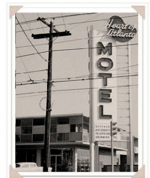
Figure 5.3 Heart of Atlanta Motel