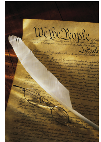
Figure 5.1 Constitution of the United States of America

As a result of this structure, the Constitution is rarely the right place to deal with contemporary political issues, no matter how important. At the state level, many states permit frequent amendments to their constitutions to reflect contemporary public policy, from school funding to gambling to gay marriage. There is often support among many people for constitutional amendments to ban flag burning,