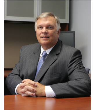
Figure 2.3 Russ Darnall—Creator of the Darnall-Preston Complexity Index

The foundation of a sound project execution plan is an assessment of the project environment. This assessment provides the information on which the execution plan is built. In the absence of an accurate assessment of the project environment, the project leadership makes assumptions and develops the execution plan around those assumptions. The quantity and quality of those assumptions will significantly influence the effectiveness of the project execution plan. The amount of information available to the project manager will increase over time and assumptions will be replaced with better information and better estimates. As better tools are developed for evaluating the project environment, better information will become available to the project manager.