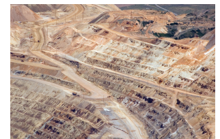
Large open pit mining project.