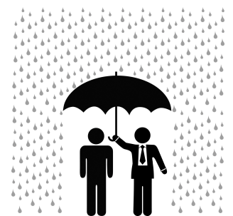
Figure 11.4 Risk Transfer

Risk transfer 18 is a risk reduction method that shifts the risk from the project to another party. The purchase of insurance on certain items is a risk transfer method. The risk is transferred from the project to the insurance company. A construction project in the Caribbean may purchase hurricane insurance that would cover the cost of a hurricane damaging the construction site. The purchase of insurance is usually in areas outside the control of the project team. Weather, political unrest, and labor strikes are examples of events that can significantly impact the project and that are outside the control of the project team.