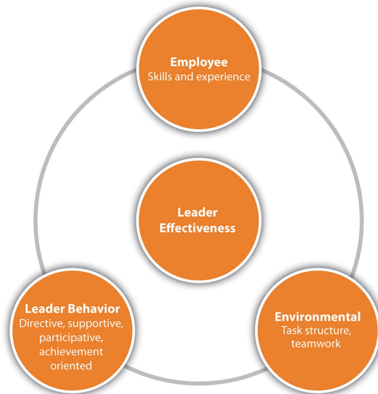
Figure 9.4 Path Goal Model for Leadership