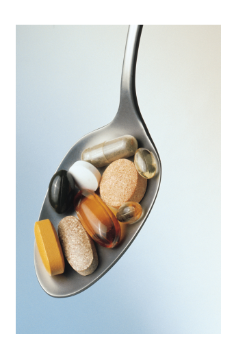
Are dietary supplements really necessary to achieve optimal health?

Some public health officials recommend a daily multivitamin due to the poor diet of most North Americans. The US Preventive Task Force also recommends a level of folate intake which can be easier