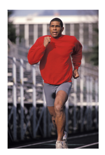
Scientific evidence continues to correlate the relationship between good dietary habits, adequate exercise, and a healthy body.

In the 1940s, little was known about the general causes of heart disease and stroke. Most doctors thought a hardening of the arteries was a natural part of aging, and that rising blood pressure with age was not a serious issue. Yet, the death rates for cardiovascular disease had been increasing steadily since the early