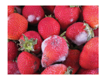
Mold can grow on fruits, vegetables, grains, meats, poultry, and dairy products, and typically appears as gray or green "fur."

Warm, humid, or damp conditions encourage mold to grow on food. Molds are microscopic fungi that live on animals and plants. No one knows how many species of fungi exist, but estimates range from ten- to three-hundred thousand. Unlike single-celled bacteria, molds are multicellular, and under a microscope look like slender mushrooms. They have stalks with spores that form at the ends. The spores give molds their color and can be transported by air, water, or insects. Spores also enable mold to reproduce. Additionally, molds have root-like threads that may grow deep into food and be difficult to see. The threads are very deep when a food shows heavy mold growth. Foods that contain mold may also have bacteria growing alongside it.