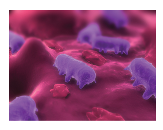
Salmonella was first identified in 1885 and many types of this kind of bacteria exist. The incidence of Salmonella infections has risen dramatically in the past few decades.

Many different kinds of bacteria can lead to food infections. One of the most common is Salmonella, which is found in the intestines of birds, reptiles, and mammals. Salmonella can spread to humans via a variety of different animal-origin foods, including meats, poultry, eggs, dairy products, and seafood. The disease it causes, salmonellosis, typically brings about fever, diarrhea, and abdominal cramps within twelve to seventy-two hours after eating. Usually, the illness lasts four to seven days, and most people recover without treatment. However, in individuals with weakened immune systems, Salmonella can invade the bloodstream and lead to life-threatening complications, such as a high fever and severe diarrhea. Centers for Disease Control and Prevention. "Salmonella." Last updated December 19, 2011. http://www.cdc.gov/salmonella/.