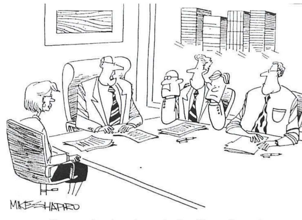
"Just reading the minutes back will be sufficient."

2. Distribute minutes promptly. When and how you disseminate minutes shows whether and how much you care about what your group does. If your group has bylaws, it may be a good idea for them to include a time frame within which minutes of meetings need to be distributed (such as "within five days").