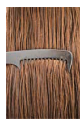
Combing your hair would be an example of a purposeful action, unlike a self-adaptive behavior.

"Adaptors<sup>20</sup> are displays of nonverbal communication that help you adapt to your environment and each context, helping you feel comfortable and secure." McLean, S. (2003). The basics of speech communication. Boston, MA: Allyn & Bacon. pp.77 A self-adaptor <sup>21</sup> involves you meeting your need for security, by playing with your hair for example, by adapting something about yourself in way for which it was not designed or for no apparent purpose. Combing your hair would be an example of a purposeful action, unlike a self-adaptive behavior. An object-adaptor <sup>22</sup> involves the use of an object in a way for which it was not designed. You may see group members tapping their pencils, chewing on them, or playing with them, while ignoring you and your presentation. Or perhaps someone pulls out a comb and repeatedly rubs a thumbnail against the comb's teeth. They are using the comb or the pencil in a way other than its intended design, an object-adaptor that communicates a lack of engagement or enthusiasm in your speech.