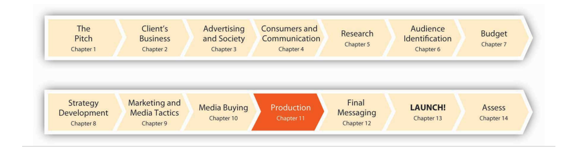
Figure 11.1 Three to Five Months to Launch!

The process of execution <sup>1</sup> determines how the message will look, read, or sound in its final form. Does it convey the right tone and attitude? Is it suited to its medium, be it print, TV, radio, outdoor, online, or alternative media? Each media vehicle offers advantages over the other vehicles on specific dimensions and requires the campaign team to create a message that takes advantage of that media vehicle's strengths. For example, television is a cool medium <sup>2</sup> (despite the "hot" images you might watch on it) because it requires a passive viewer who exerts relatively little control (remote-control "zipping" notwithstanding) over content. In contrast, print is a hot medium <sup>3</sup>. The reader is actively involved in processing the information and is able to pause and reflect on what she has read before moving on.Herbert E. Krugman, "The Impact of Television Advertising: Learning without Involvement," Public Opinion Quarterly 29 (Fall 1965): 349–56.