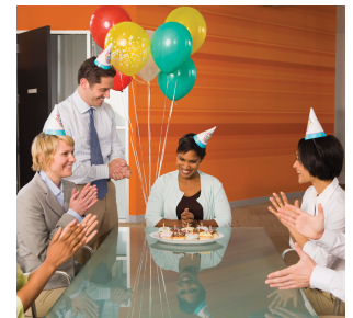
Gathering to celebrate a colleague's birthday is a good way for coworkers to achieve relational goals in the workplace.

Another form of relational talk that I have found very useful is what I call the DTR talk 3 , which stands for “defining-the-relationship talk” and serves a relationship-maintenance function. In the early stages of a romantic relationship, you may have a DTR talk to reduce uncertainty about where you stand by deciding to use the term boyfriend , girlfriend , or partner . In a DTR talk, you may proactively define your relationship by saying, “I’m glad I’m with you and no one else.” Your romantic interest may respond favorably, echoing or rephrasing your statement, which gives you an indication that he or she agrees with you. The talk may continue on from there, and you may talk about what to call your relationship, set boundaries, or not. It is not unusual to have several DTR talks as a relationship progresses. At times, you may have to define the relationship when someone steps over a line by saying, “I think we should just be friends.” This more explicit and reactive (rather than proactive) communication can be especially useful in situations where a relationship may be unethical, inappropriate, or create a conflict