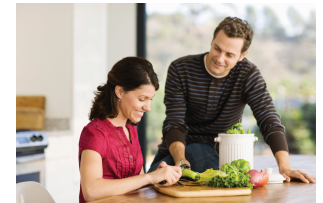
A couple may share a relationship routine of making dinner together every Saturday night.

Whether the routines and rituals involve phone calls, eating certain foods, or digging for belly button fuzz, they all serve important roles in building relational cultures. However, as with storytelling, rituals and routines can be negative. For example, verbal and nonverbal patterns to berate or belittle your relational partner will not have healthy effects on a relational culture. Additionally, visiting your in-laws during the holidays loses its symbolic value when you dislike them and comply with the ritual because you feel like you have to. In this case, the ritual doesn't enrich the relational culture, but it may reinforce norms or rules that have been created in the relationship.