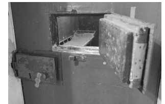
Solitary confinement is common in supermax prisons, where prisoners spend 22.5 to 24 hours a day in their cells.

Aside from making your relationships and health better, interpersonal communication skills are highly sought after by potential employers, consistently ranking in the top ten in national surveys. National Association of Colleges and Employers, Job Outlook 2011 (2010): 25. Each of these examples illustrates how interpersonal communication meets our basic needs as humans for security in our social bonds, health, and careers. But we are not born with all the interpersonal communication skills we’ll need in life. So in order to make the most out of our interpersonal relationships, we must learn some basic principles.