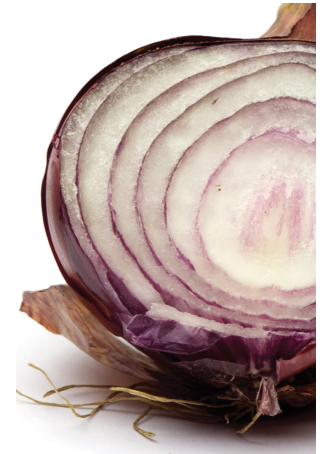
Social penetration theory compares the process of self-disclosure to peeling back the layers of an onion.