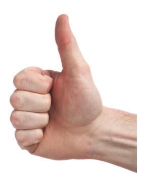
Emblems are gestures that have a specific meaning. In the United