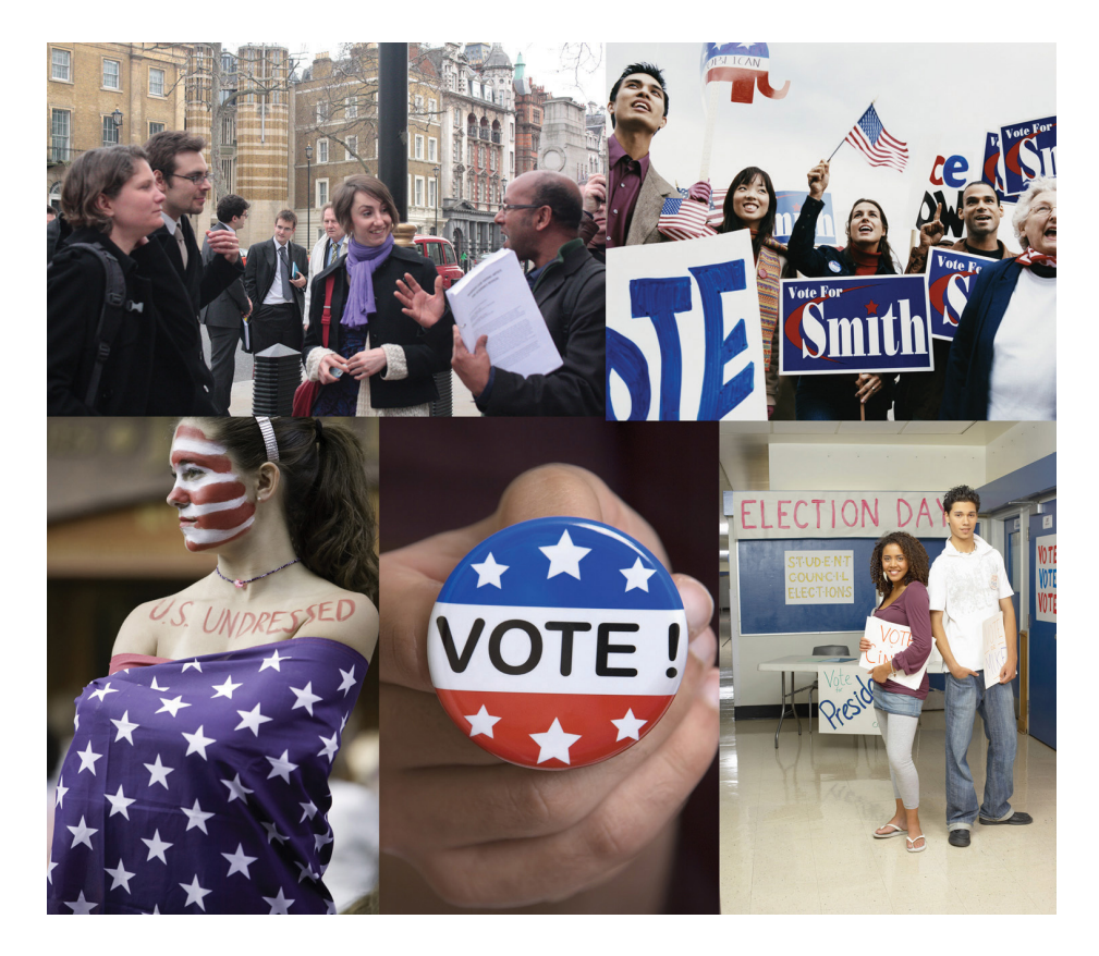
Young people participate in different ways. Media often depict young people as being disinterested in voting, but this portrayal does not reflect the fact that many young voters engage actively in elections.

The "apathetic youth voter" frame focuses on elections, but it typifies the media's dominant image of the American public, which is portrayed as politically disengaged, alienated, disinterested, and uninformed. Media images of the general public's political involvement are unflattering, but depictions of young people are worse. Mainstream media portray young people as irresponsible, self-centered, and lacking the motivation to become involved in government and politics.