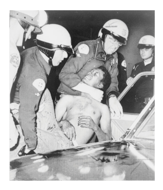
Figure 8.6 The Watts Riots

The Watts riots in 1965 were the first of a number of civil disturbances in American cities. Although its participants thought of them as political protests, the news media presentation rarely gave that point of view.