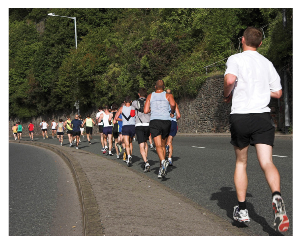
People take part in support activities on behalf of a cause, which can lead to greater involvement.