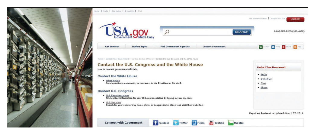
The directive to "write your member of Congress" is taken seriously by increasing numbers of citizens: legislators' email boxes are filled daily, and millions of letters are processed by the Capitol Hill post offices.